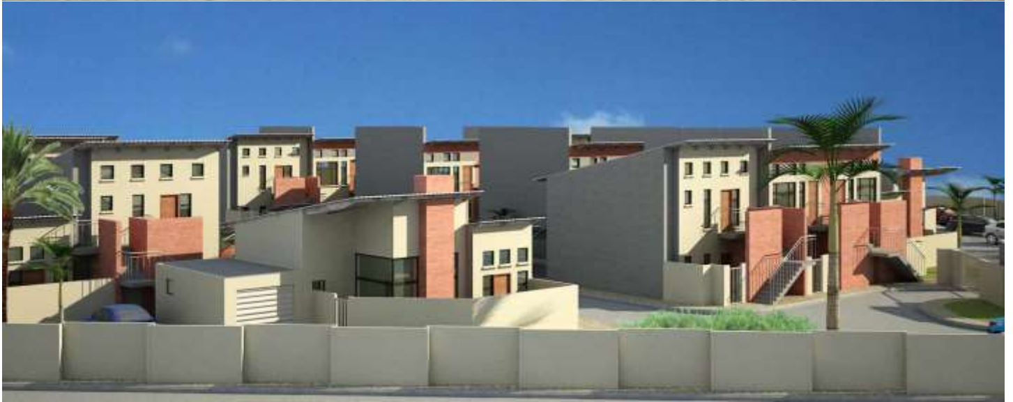
Completed Units – August 2009